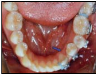
381 Air-Rotor Stripping