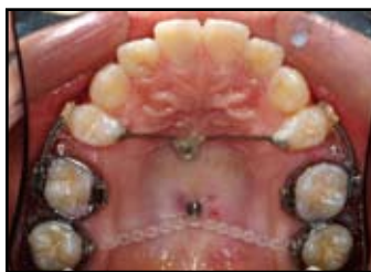
400 Miniscrew Anchorage